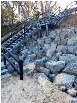
Access stairs and rock revetment