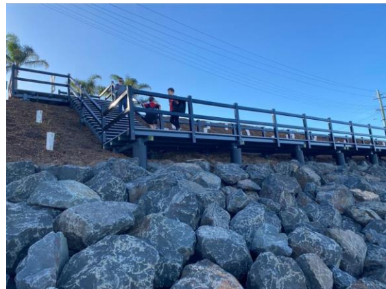
Rock revetment and segment of the boardwalk