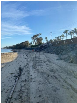
Beach nourishment works