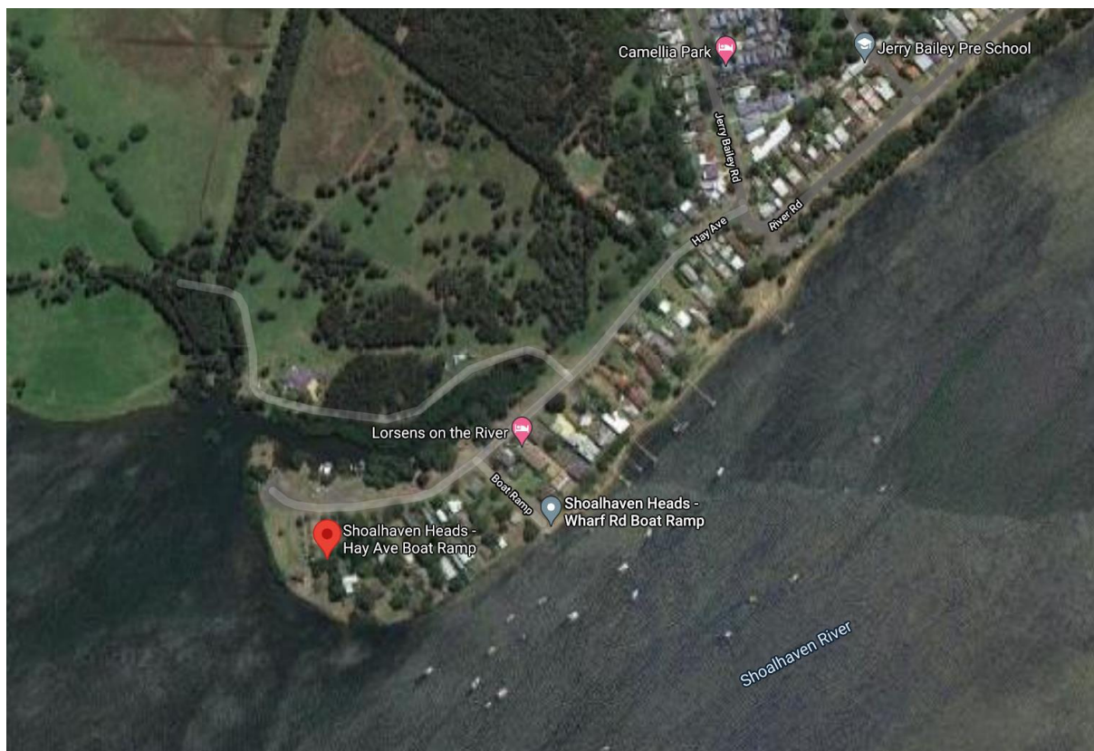
Figure 1: Wharf Road Boat Launching Ramp, Shoalhaven River

It is noted that Council has advised the current highest priority for upgrading of boat ramps at Shoalhaven Heads is the Wharf Road boat ramp further upstream in the Shoalhaven River, as shown in Figure 1. If this facility is upgraded within the next two years, the design of the navigation channel to the Holiday Haven Caravan Park boat ramp may require further consideration.