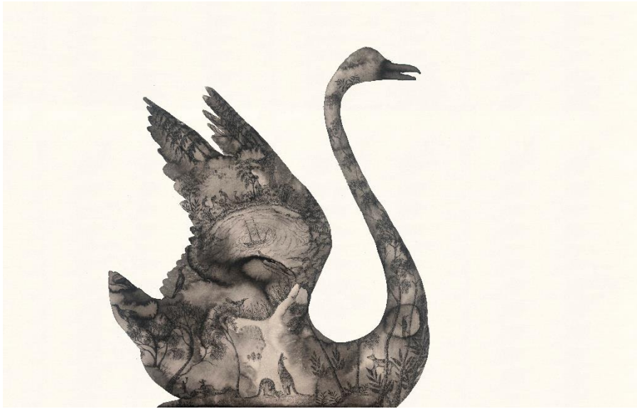
'Black Swan / After Port Jackson Painters' Ink & pencil on Arches paper 65cm X 102cm 2016 $5,454 (ex GST)