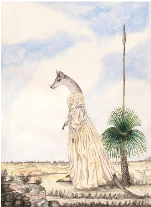
'Colonial Hybrid Reimagined from Raper - Gum-plant, & kangaroo of New-Holland 1789' Ink, watercolour & pencil Arches paper 51cm X 66cm 2017 $3,273 (ex GST)

The proposed purchase meets the criteria of the Shoalhaven City Council Art Collection under section 3.1.6 under the following considerations: