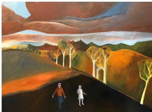
South Coast Landscape (1992) acrylic on canvas, 92 x 122 cm

They show one of the artist’s favourite themes, children playing in the landscape and figures in the landscape; both are inspired by the South Coast. They encompass a period from the artist’s mid-career (1992) to his later years; Children Playing, South Coast was painted two years before his death.