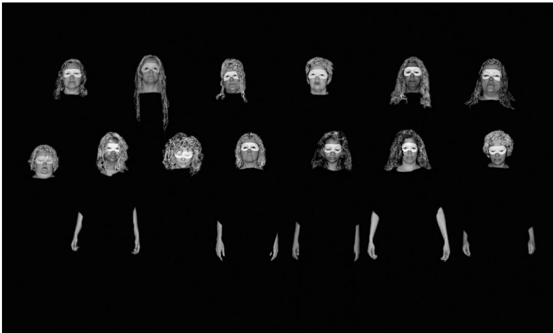
DEATH LOVE ART, Women in Mourning 1, by Maree Clarke