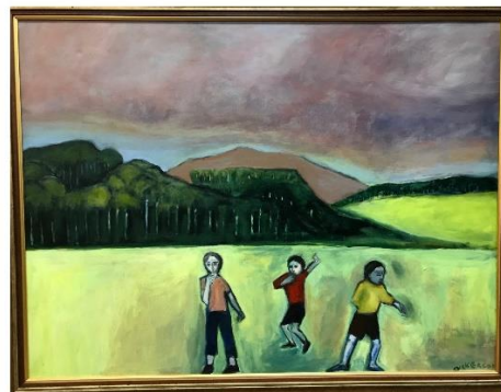
Children Playing, South Coast (2013), acrylic on canvas, 92 x 122 cm