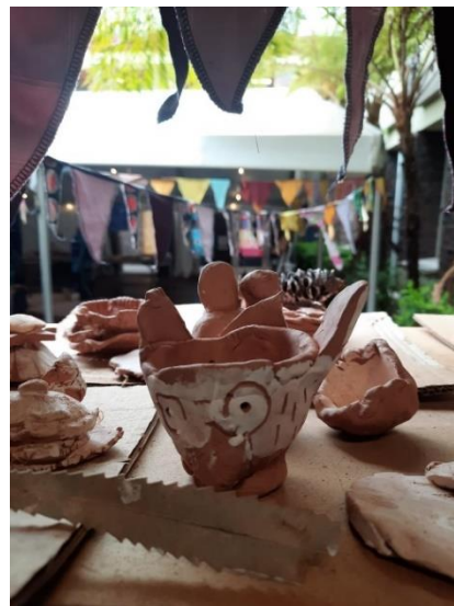
Under the marquee: Clay Playground work, hand built under the creative guidance of art educators.