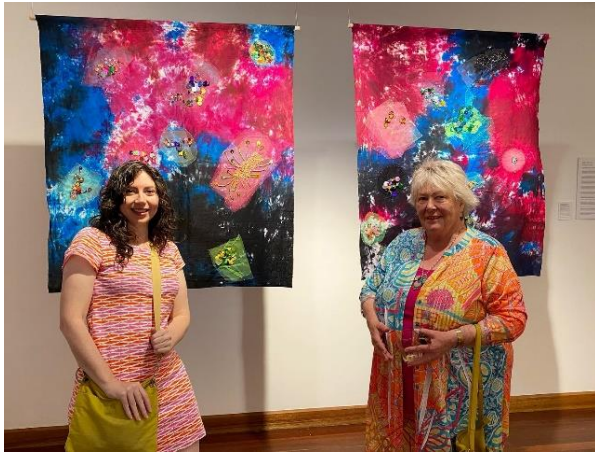
Participants of Liam Benson's workshop 'Domesticity Deserves to be Sequined' with the collaborative work of the artist in background.