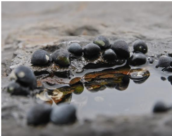
Still image from Harry Kielly's (Drummerboy Pictures) film 'Shelled Shoes' produced alongside the exhibition.