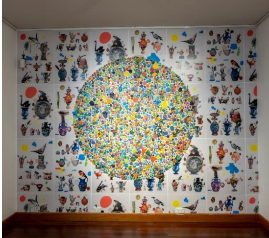
'I Was Born Into A Coloured Country' roundel of individual ceramics with wallpaper by Glenn Barkley.