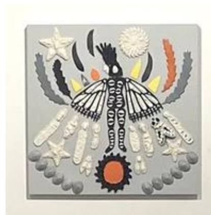
'Nowra Monarch' – porcelain, wax thread, paint and wood tile by Cita Daidone in 'Frivolity in Fire'