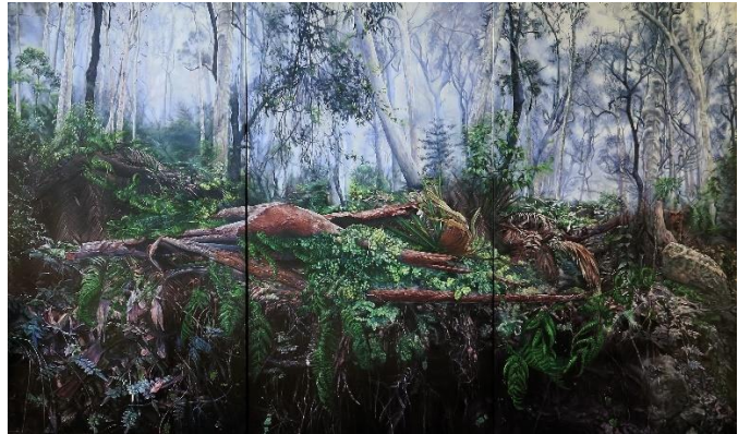
Large scale painting 'Bundanon Floor to Sky' by Gina Kalabishis