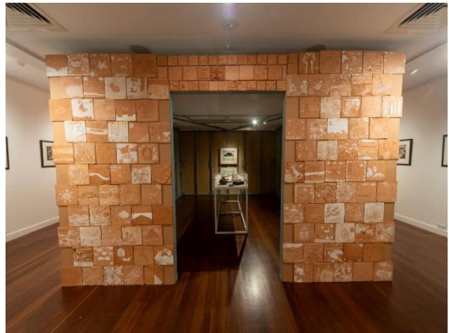
'The Wonder Room' – hundreds of tiles made by local communities reflecting on the Shoalhaven for the exhibition.