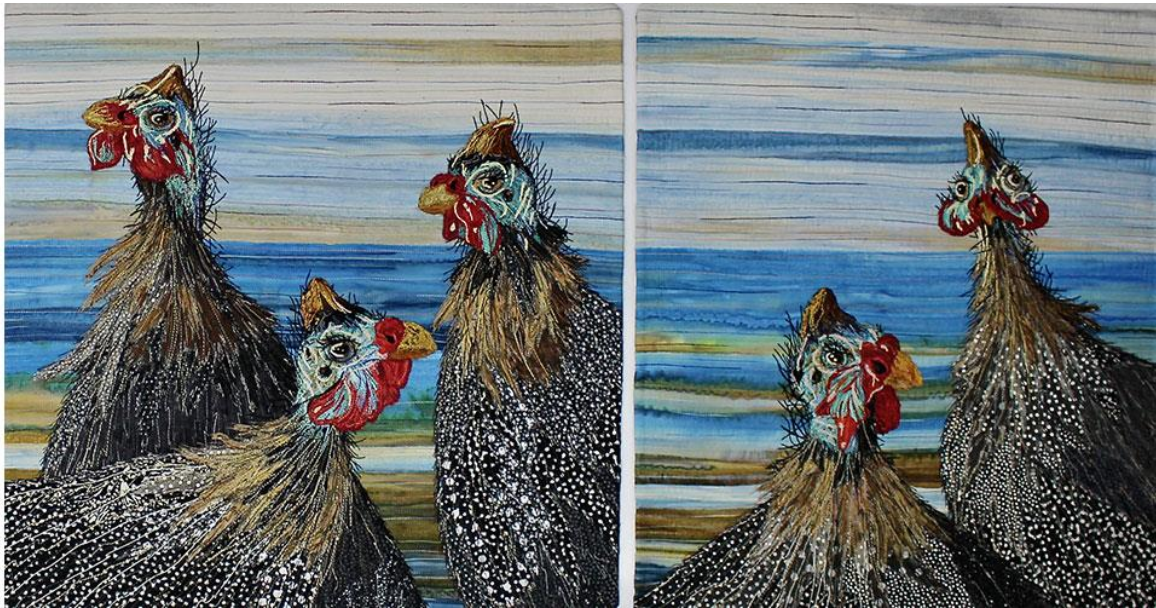
Absurd Birds Zara Zannettino (Art Quilt Australia 2021)