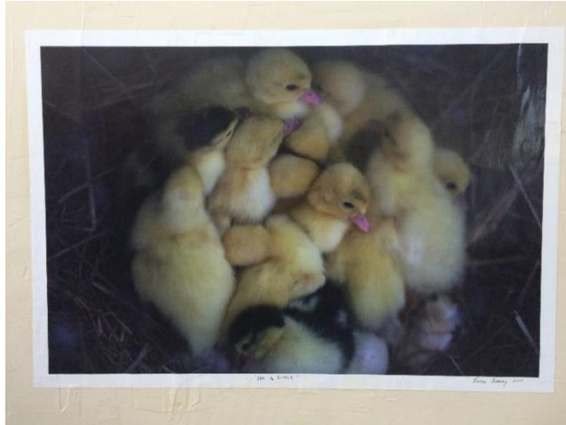
Live a little (ducklings born)