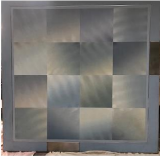
Echo Overload No 4 , 1976 Mixed media, metal and paint on canvas 1770mm x 1770mm

We have been offered the work Echo Overload No 4 by David Voight, dated 1976.