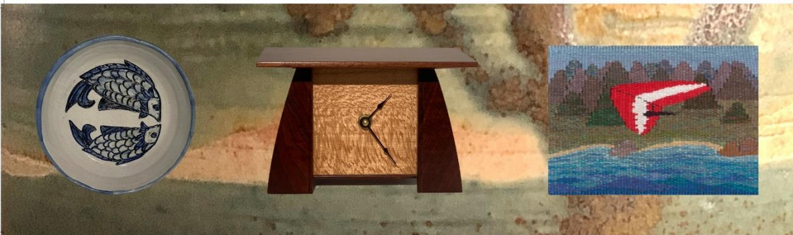
Creative Moments From the Mountains to the Seas