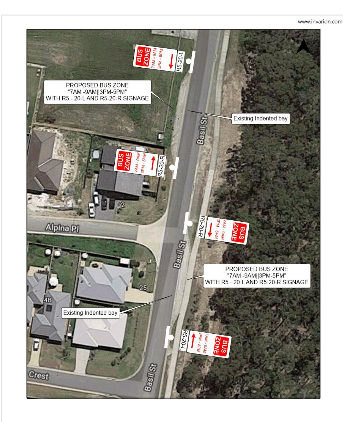
Bus Zone Basil Street, South Nowra