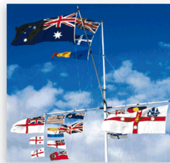
FLAGS FLOWN AT SOUTH HEAD SIGNAL STATION, NSW

The rules for flying flags on non-defence ships are set out in sections 29 and 30 of the Shipping Registration Act 1981 and regulation 22 of the Shipping Registration Regulations. Foreign vessels may, as a courtesy, fly from the foremast either the Australian National Flag or the Australian red ensign when berthed in an Australian port.