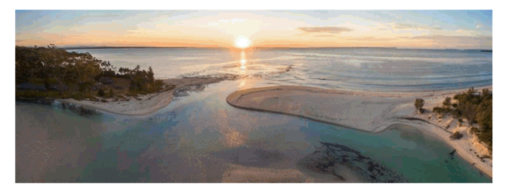
"the trusted voice of international tourism for the South Coast"