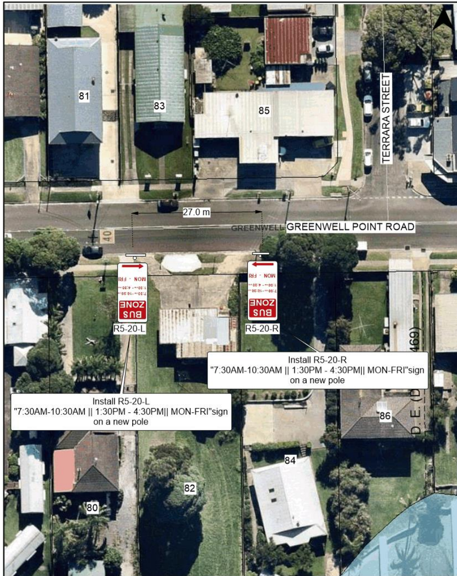
Bus Zone Relocation 82 Greenwell Point Road, Greenwell Point