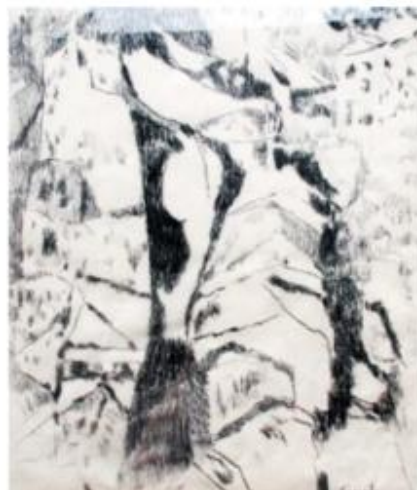
02 004 In the Valley 2014 Charcoal on paper 65 x 75 cm