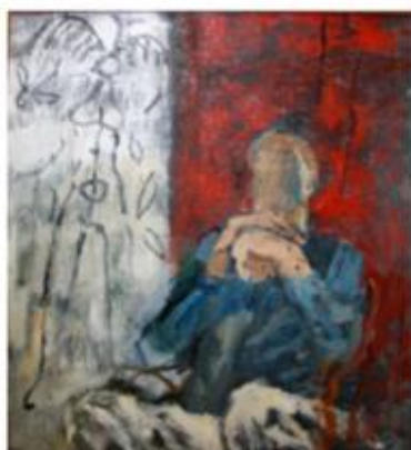
06 0000 Study for Sea Women 2008 oil on board 37 x 51