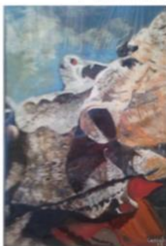
01 001 Before the Storm 2008 Oil on board 40 x 50 cm