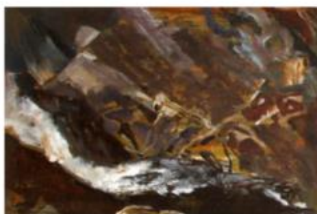
07 006 Waterfall in rainforest 2011 Oil on paper on board 26 x 34 cm