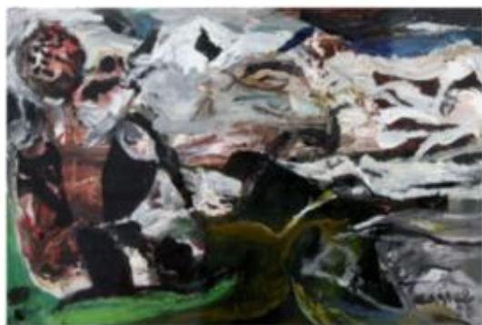
07 198 Stormy Landscape 2008 Oil on paper 15 x 24 cm