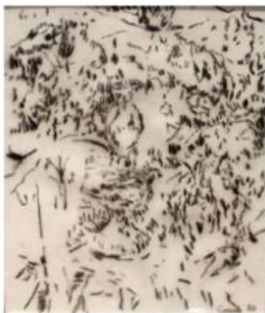
04 001 The Mountain 2008 Charcoal on paper 14 x 20 cm