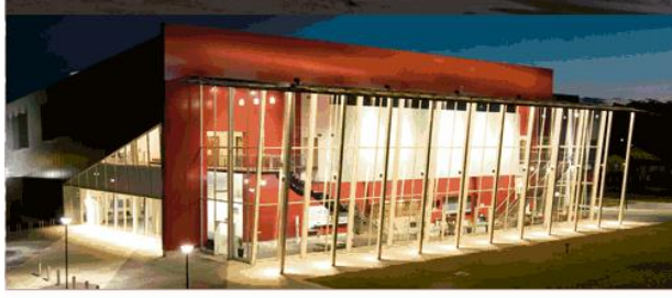
"Creativity and participation in the arts contributes to innovative and sustainable outcomes that benefit everyone in the community, not just those who participate."