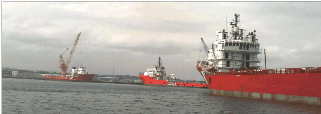
Oil and gas industry support vessels at Barry Beach Marine Terminal, the Port of Corner Inlet, Victoria.