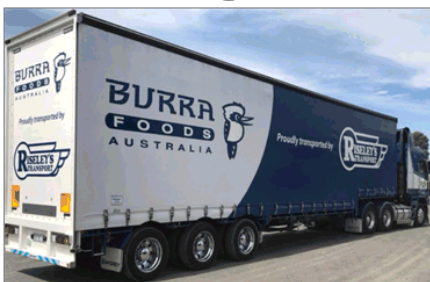
All goods in and out of Burra Foods Korumburra site are transported by road.

1. Challenges to Melbourne: Roadworks on Monash Freeway and traffic congestion on M1