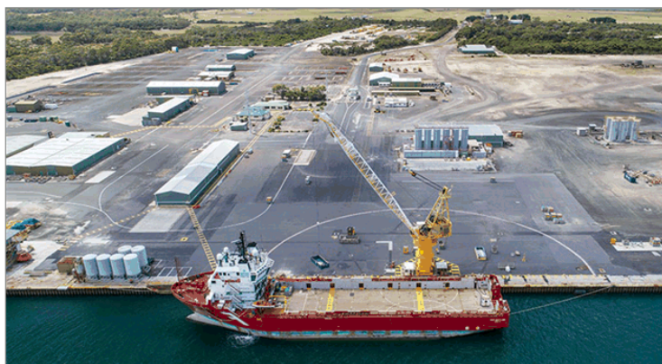
Barry's Beach Marine Terminal, managed and operated by Qube.